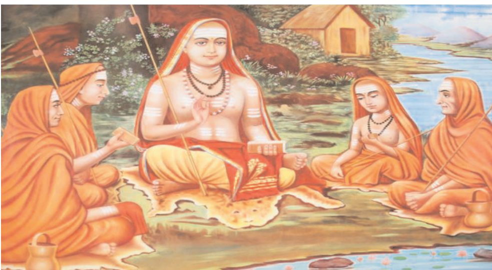
A.S. Altekar, Vedic education focused on three major objectives: Character

Truthfulness, self-control, cleanliness, generosity, and moral conduct were considered essential virtues. Students were instructed to honor parents, teachers, and guests while adhering to ethical principles.