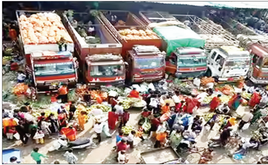
major logistics disruption.