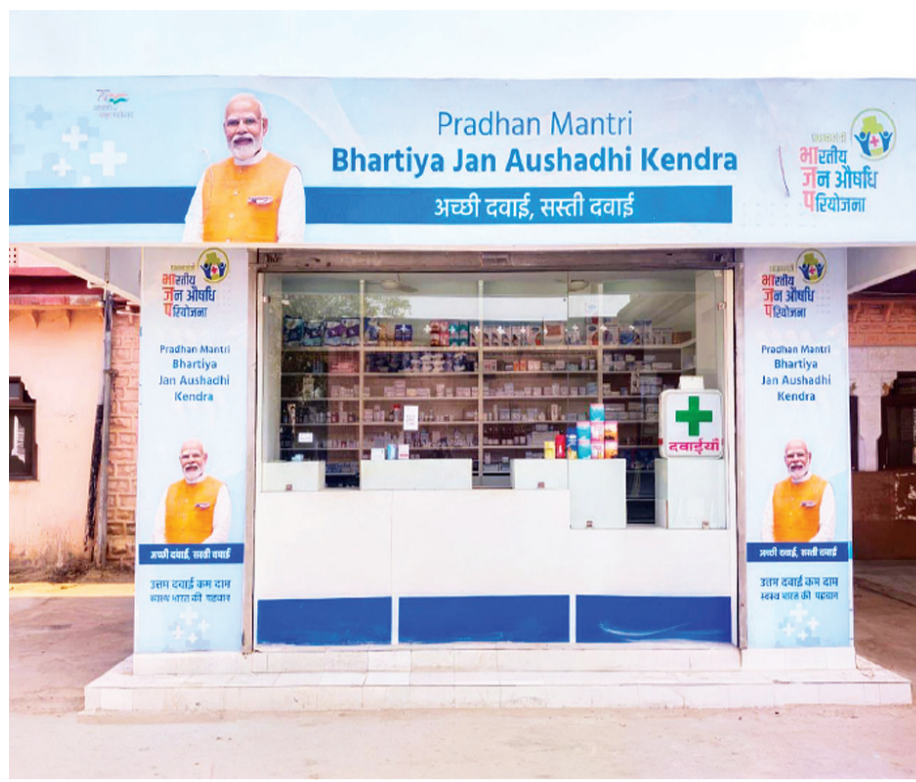
far, 120 PMBJKs out of the opened, reflecting steady planned 150 have been progress in expanding afford-

The initiative gained momentum on 12 March 2024, when 50 PMBJKs were inaugurated by the Hon'ble Prime Minister. Building on its success, Indian Railways approved the expansion of 100 additional Kendras. So