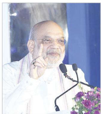
important role in taking Gujarat to new heights.

development and progress are ingrained in the nature of Gujaratis. Under the leadership of Prime Minister Narendra Modi, Gujarat will no longer be a production-based state, but will become a global hub for service, knowledge, and a modern technology-based economy. He said that both the projects inaugurated today will provide new opportunities to the youth of the state and will play an