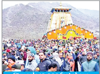
Struggle 12,000 feet above

family was unable to pay the rent regularly. It is alleged that the landlord demanded sexual intercourse from the woman in exchange for waiving the outstanding rent. The husband agreed. Subsequently, the landlord raped the woman multiple times. Minor daughter was also tortured: After the tenant's wife, the landlord also targeted his minor daughter.