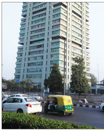
and Rohtak Road areas. Most of them are vacant, officials said.

Accelerating the implementation of the recently notified Transit-Oriented Development (TOD) policy, the identified plots, spread across more than 3.6 lakh square metres, are situated along the Blue, Red, Green, Pink and Yellow metro lines. Six of the sites are in east Delhi - Dilshad Garden, Jhilmil, Preet Vihar, Karkardooma and Mandawali/Fazalpur - while three are in Dwarka. The remaining plots are located in Rohini, Madipur, Peeragarhi