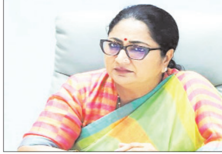
ing the Delhi Fire Service, MCD and DDMA.