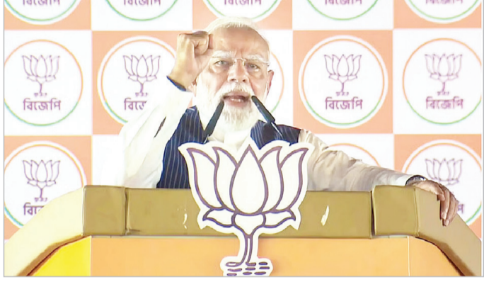
and goons have started considering themselves

Kolkata, (GNS): PM Narendra Modi held a rally in Bangaon, North 24 Parganas district, West Bengal. He said, "The TMC's arrogance has been shattered in the first phase of voting. The BJP's victory in the second phase seems certain." The PM alleged that under TMC rule, small-time leaders