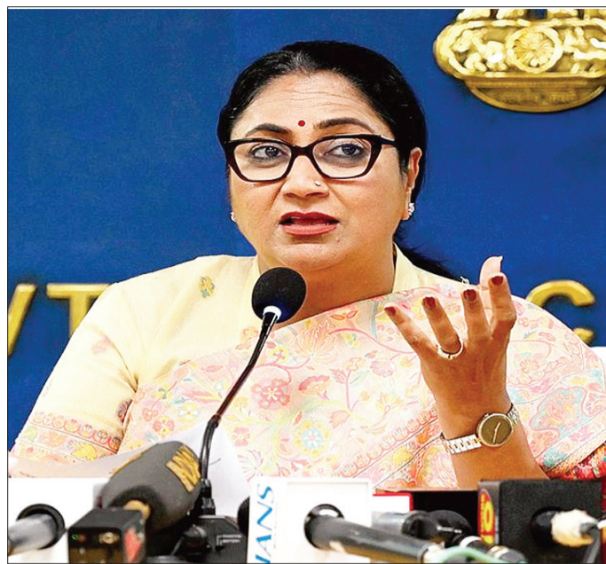
As a woman Chief Minister, this issue is not merely political but one of deep sensitivity and respect," she said, adding that the opportunity for crores of women to take part in decision-making had been denied.

Referring to the Nari Shakti Vandan Act, Gupta said the legislation represented a "historic and transformative" step towards women's empowerment under the leadership of Narendra Modi. She alleged that preventing the passage of the Constitutional Amendment amounted to an injustice to women aspiring for greater participation in govern-