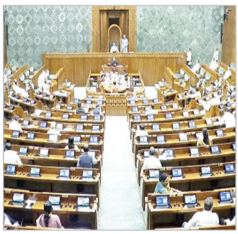
The Lok Sabha currently has 543 seats. The

New Delhi(GNS): The government has proposed increasing the number of Lok Sabha seats to 850 to implement the Women's Reservation Act from the 2029 Lok Sabha elections. According to sources, 815 of these seats are proposed for states and the remaining 35 for union territories.