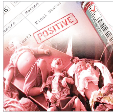
children contracted HIV from a contaminated needle during hospital treatment.

Islamabad(GNS): In Taunsa, a city in Pakistan's Punjab province, 331 children tested positive for HIV. These cases were recorded between November 2024 and October 2025. Now, allegations of serious negligence have been leveled at the government hospital. A BBC report found that syringes were being reused at THQ Taunsa Hospital. According to the report, in many cases, the same medication vial was used to inject different children, increasing the risk of spreading the infection. The case came to light after the death of eight-year-old Mohammad Amin. His sister, Asma, is also HIV positive. The mother says the