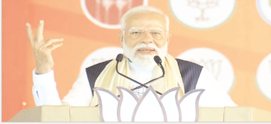
Motkas, Misings, and Deoris, have some Bengali, and some Hindi, lived here in harmony for centuries. Some speak Assamese, but everyone shares the same dream: a developed Assam and a

He praised Assam's cultural diversity and unity, saying the state has a glorious legacy of "Ek Bharat Shreshtha Bharat" (One India, Best India). Various communities, including the Ahoms, Koch-Rajbongshis, Morans,