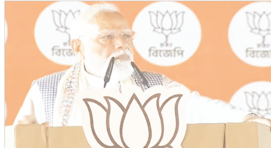
Kolkata(GNS): Prime Minister Narendra Modi said at an election rally in Cooch Behar, West Bengal, on Sunday that the TMC's "veil of sins has been filled," and the public now wants change. After the elections,

► These people will make it difficult for Hindus to live in Bengal: Prime Minister Narendra Modi said that Bengal's great identity is being distorted in this game of appeasement. The TMC has just released its manifesto, but it hasn't been titled in Bengali, instead calling it a commercial. Think about how they are changing the identity of West Bengal. You know what the Red Proclamation was used for in Bengal. In 1905, religious forces issued the Red Proclamation in Bengal. Hindus were massacred after that. The TMC wants to remind us of that. You must not forget that under this ruthless government, open threats are being issued. These people of a particular religion will make it difficult for Hindus to live in Bengal. ► I trust the Election Commission, the elections will be fair: PM Modi said, "This election will decide the future of your children. So, vote for your children's future. Cast your vote for your family. Seal the seal of change by voting for the BJP. I have faith in the Election Commission that this time the elections will be fair." ► Bengal is the land of Shakti worship: Narendra Modi said that our Bengal is the land of Shakti worship. I would like to tell all the sisters and daughters present here, every daughter of Bengal, that the BJP is in the field for your respect and prosperity.