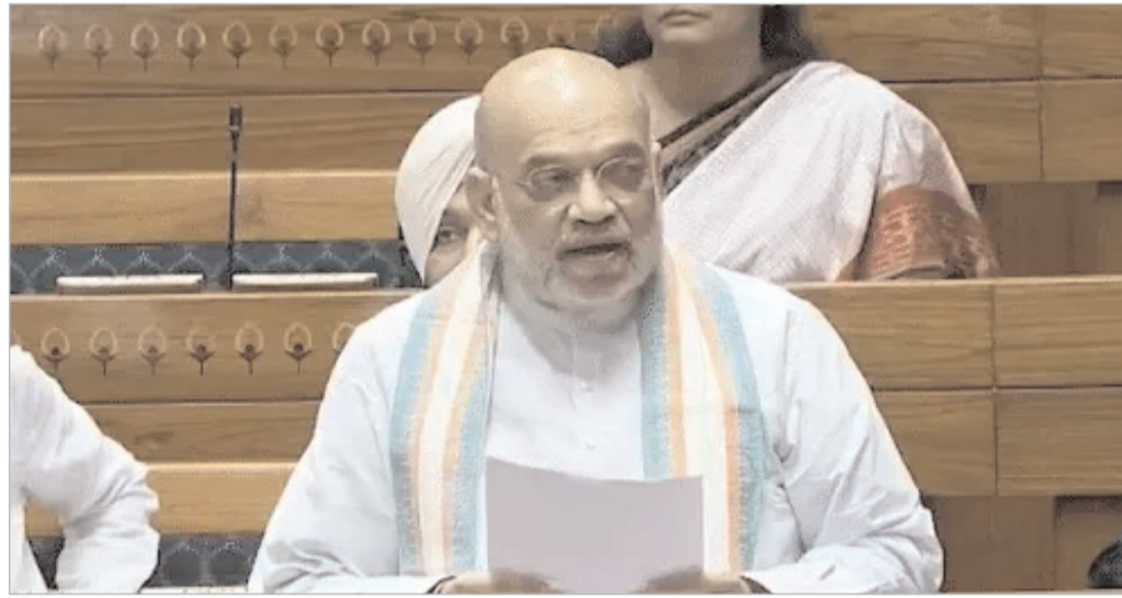
Naxalism in Parliament Shah has repeatedly eradicated from the country by March 31, government's deadline. will be completely 2026.

New Delhi, (GNS): Home Minister Amit Shah said in the Lok Sabha on Monday that India has become Naxal-free, we can say so. During his one-and-a-half-hour speech, Shah said, "We had set a goal of making the country Naxal-free by March 31st. I will inform the nation once all the arrangements are in place." Shah said, "Those who reject the entire system and take up arms will have to pay the price. For years, innocent tribal people were kept in the