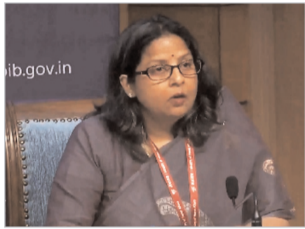
Salman. He said that during this conversation, views were exchanged regarding the ongoing conflict in West Asia. The Prime Minister

New Delhi, (GNS): Amidst the ongoing crisis in West Asia, the government has assured citizens and industry of continued uninterrupted fuel supply. The Ministry of Petroleum and Natural Gas has clarified that despite the global situation, the country has adequate reserves of petrol, diesel, LPG, and natural gas. However, amid reports of the panic buying by consumers in some areas, the central government has taken