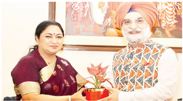
with long-term goals for a more sustainable and citizen-centric

According to officials, the meeting focused on aligning governance priorities