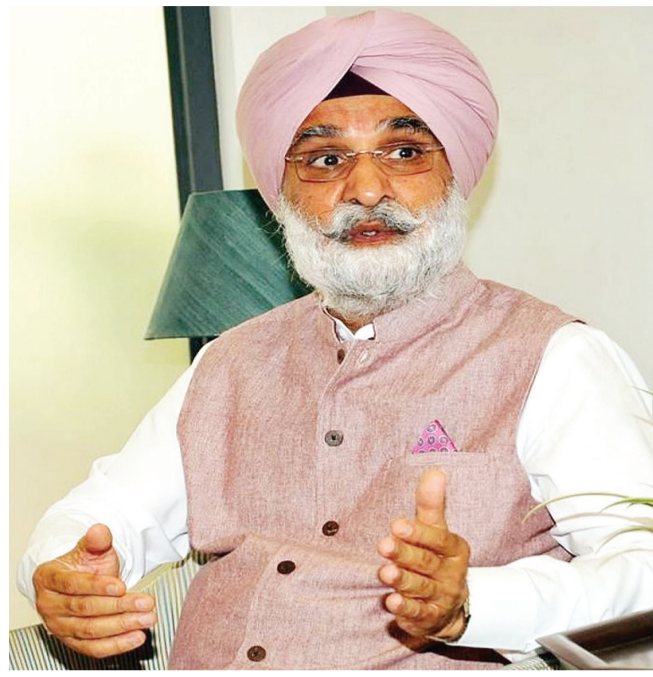
the SGPC and in recognition of his services to the Sikh Panth, the SGPC named its