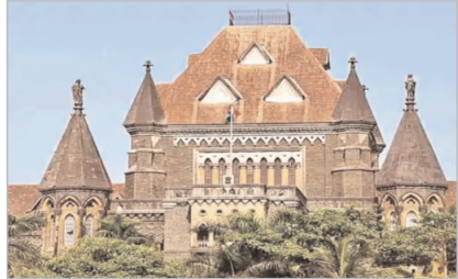
gation of cruelty under Section 13(1)(ia-a) of the Hindu Marriage Act, 1955 must be proved by