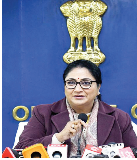
The task force includes senior officials from key departments such as transport, urban development, finance,

Chief Minister Rekha Gupta has constituted a high-level task force under the chairmanship of the Chief Secretary to prepare the draft Bill at the earliest.