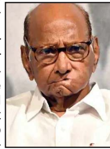
Sharad Pawar said the incident has deeply affected not only the Pawar family but the entire state, and urged people to focus on mourning the loss and supporting those affected, rather than indulging in speculation.