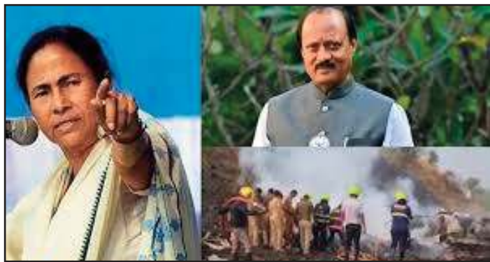
Mamata Banerjee and Ajit Pawar. Banerjee questioned the overall security situation in the country and said even senior political leaders were not safe.