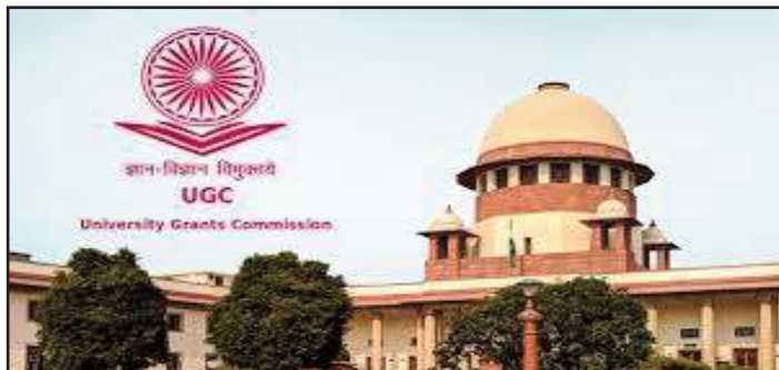
The Supreme Court of India stayed the University Grants Commission (Promotion of Equity in Higher Education Institutions) Regulations, notified on January 23, 2026, due to vagueness and potential misuse, directing the Union government to redraft the rules while the old system continues.

The CJ remarked that if the court does not intervene at this stage, the regulations could divide society and lead to long-term harm. He added that the goal should be to ensure fairness without creating new forms of exclusion. The court also asked Solicitor General Tushar Mehta to consider the formation of a committee of eminent jurists, academicians, and social experts to review the regulations so