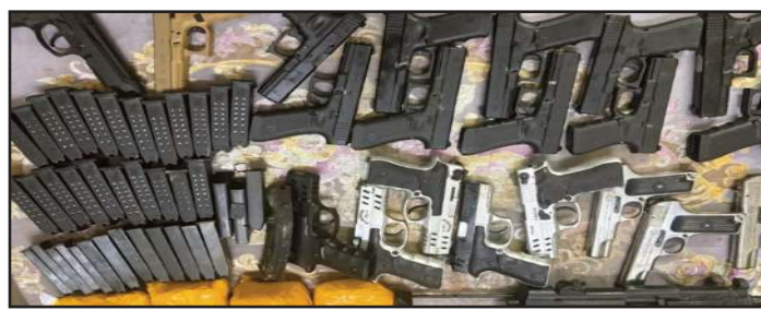
In a major breakthrough in the ongoing drive to make Punjab a safe and secure state, as directed by Chief Minister Bhagwant Singh Mann, Counter Intelligence (CI) Faridkot, in coordination with the Border Security Force (BSF), has successfully foiled a major cross-border smuggling attempt along the land border near Border Outpost (BOP) GG-3 at village Teja Rahela in Fazilka.

tion in the early hours of Thursday in the area of village Teja Rahela, Fazilka. During the operation, Pakistani smugglers attempted to push the consignment, but BSF troops responded swiftly and successfully thwarted the attempt, resulting in a substantial seizure of arms, ammunition, and narcotics from the spot. The AIG further stated that further investigations are underway to identify and trace local smugglers and to unravel the entire smuggling network involved in the cross-border operation. In this connection, FIR No. 01 dated 29-01-2026 has been registered under Sections 21-C and 29 of the NDPS Act and Section 25 of the Arms Act at Police Station SSO Fazilka.