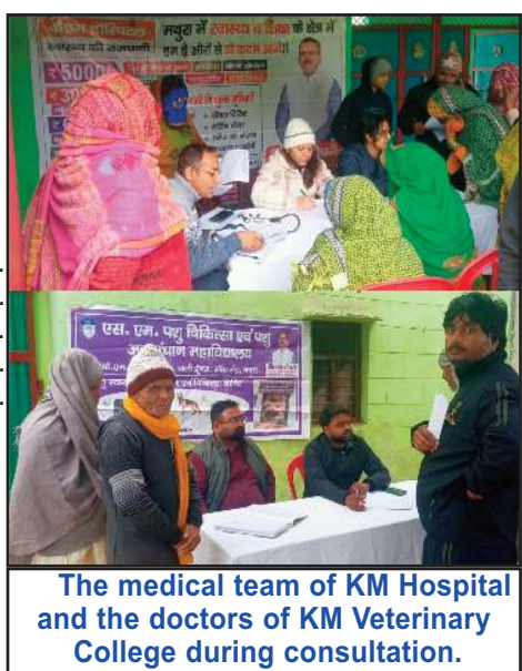
The medical team of KM Hospital and the doctors of KM Veterinary College during consultation.

eye diseases were examined and treated. Along with free medical consultation, medicines were also