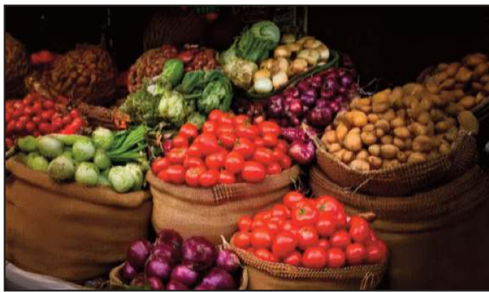
India has recorded one of the sharpest declines in headline inflation among major emerging economies, with domestic inflation averaging a historic low of 1.7 per cent during April-December 2025, according to the Economic Survey 2026.

onions, tomatoes and potatoes fell steeply, aided by higher production, timely trade measures and strategic buffer stock management. Core inflation remained relatively stable, with a modest uptick attributed largely to rising prices of precious metals amid global uncertainty. Importantly, the easing of inflation has also translated into reduced rural stress. The Economic Survey observed that, unlike in 2023 and 2024, when rural inflation exceeded urban inflation, rural inflation declined in 2025 and remained lower than urban inflation, reflecting the sharp fall in food prices and offering relief to rural households.