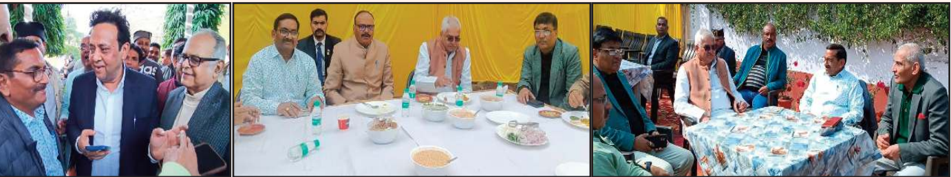
The confluence of journalism and politics gathered in the Press Club.