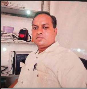
File photo of deceased JE