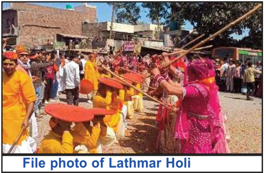
File photo of Lathmar Holi

adorable Huriyare. Thakur Banke Bihari will shower blessings on his devotees by applying gugal on their