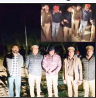
Police team at the encounter site