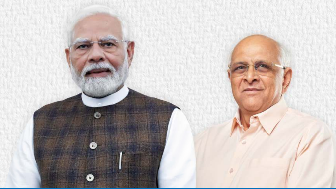
Shri Narendra Modi Hon'ble Prime Minister