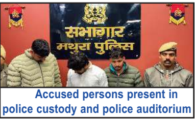
Accused persons present in police custody and police auditorium