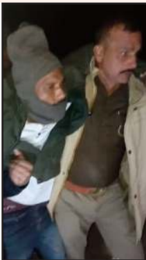
Sadar Bazar Police and SWAT team at the encounter site