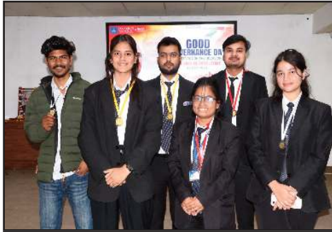
Winners of the speech and poetry competition held at Sanskriti Vishwavidyalaya with their medals.

competition, students remembered Atal ji as a