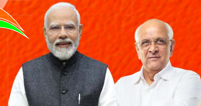
Shri Narendra Modi Hon'ble Prime Minister