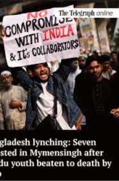
Bangladesh lynching: Seven arrested in Mymensingh after Hindu youth beaten to death by mob

Muhammad Yunus, the Chief Adviser of the Interim government of Bangladesh, confirmed the development in a post on X. The post read, "10 Arrested in Mymensingh Hindu Youth Beating Murder Case: Law enforcement agencies have arrested ten