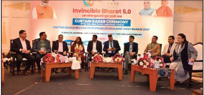
Invincible Bharat 5.0 - Uttar Pradesh Mukhyamantri Yuva Udyami Yatra' to Begin from Lucknow

Covering nearly 2,500 kilometres, the Yatra will organise a two-day programme in each of the 25 districts. Every district event will feature a Kaushal Mela, multi-sector skill and career pavilions, on-the-spot skill registrations.