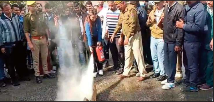
The fire department team is accompanied by the general manager and staff of the hospital during the mock drill.

Suggested fire prevention methods to doctors and hospital staff