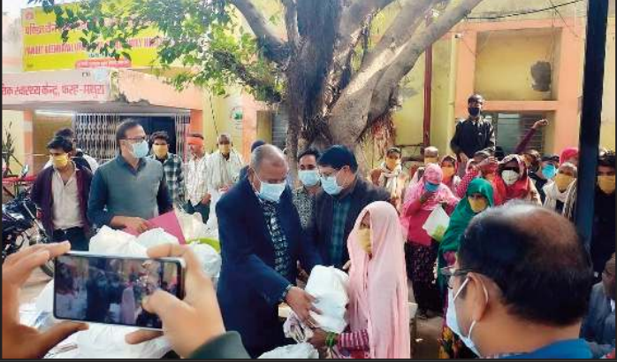
563 people got nutritious food