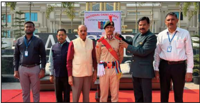
Officers awarding their ranks to cadets for their excellent performance on the 78th NCC Day at Sanskriti University.