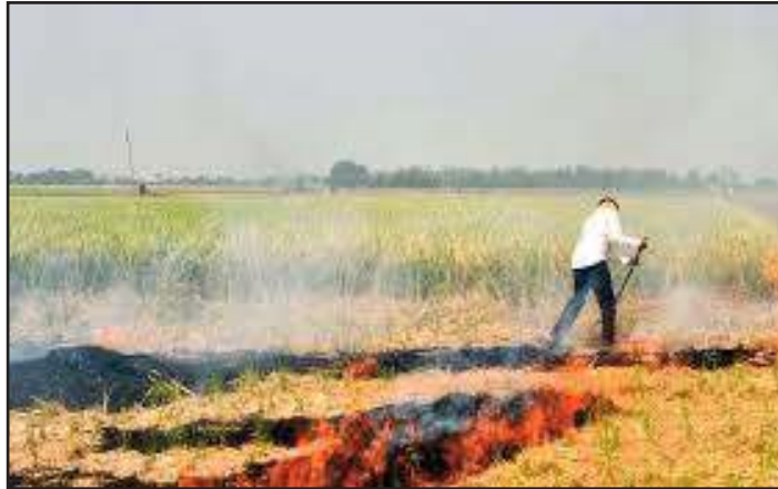
reported from the state in 2021. CAQM officials attributed the reduced farm fire events to stricter implementation of the State and District-specific Action Plans, boosting the in-situ paddy straw management, the agency said the measures now include biomass-based power generation, use of straw in industrial boilers, production of bio-ethanol, and mandatory co-firing of paddy straw pellets

(Gns). The Commission for Air Quality Management (CAQM) on Monday said farm fire incidents during this year's paddy harvesting season, officially recorded from 15th September to 30th November, have witnessed a significant decline in the last five years, particularly in Punjab and Haryana. The agency attributed the declining numbers to stricter state-wide monitoring and enforcement measures. According to government data, Punjab recorded 5,114 fires this season, registering a drop of 93 per cent from 2021 count's which stood at a towering figure of 71,304 in 2021. A similar decline was noted in Haryana, which logged 662 fires, the lowest in five years, in contrast to 6,987 stubble burning incidents and ex-situ stubble management measures. Expanding on ex-situ or briquettes in thermal power plants and brick kilns. It added that paddy straw is also being used in packaging and other commercial applications. The agency also noted ground-level inspection and enforcement by flying squads, Parali Protection Force, field officers and continuous monitoring across hotspot Districts, among other measures, reducing the stubble burning numbers. Meanwhile, fire counts in neighbouring states rose. Rajasthan recorded 2,890 fires this season, up from 2,772 last year. Uttar Pradesh logged 7,290 fires, compared to 6,142 last season. Madhya Pradesh saw the sharpest rise, with 17,067 fires this year versus 16,360 last year.