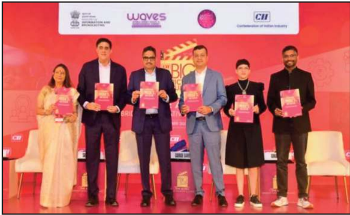
try to view the WAVES Summit not as a standalone event, but as part of an ongoing movement—one that continually inspires new waves of creativity, innovation, and progress. "The WAVES Summit is much