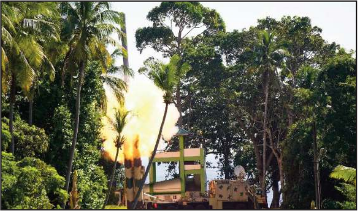
The mission met all operational objectives under simulated battle conditions, reaffirming the high state of operational readiness of the Indian Army's BrahMos units and their capability to undertake real-time precision strike missions to address emerging battlefield challenges.

(Gns). The Indian Army today successfully carried out a combat missile launch of the BrahMos Supersonic Cruise Missile from a test range in the Bay of Bengal. The launch was executed in a precisely coordinated mission involving a BrahMos unit of Southern Command and elements of the Tri-Services Andaman and Nicobar Command. In a statement issued here today, the Ministry of Defence stated that the missile, equipped with advanced guidance and control systems, validated its performance, high-speed flight stability and terminal accuracy by engaging a designated target with precision. The mission met all operational objectives under simulated battle conditions, reaffirming the high state of operational readiness of the Indian Army's BrahMos units and their capability to undertake General Officer Commanding-in-Chief, Southern Command, lauded the successful combat launch of the BrahMos missile. This successful launch marks a major milestone in the Army's continued efforts to enhance long-range precision strike capability and reinforce deterrence. The launch once again demonstrated the accuracy, reliability and effectiveness of India's indigenous missile systems, reflecting steady progress in the nation's strategic and technological competencies, the ministry stated.