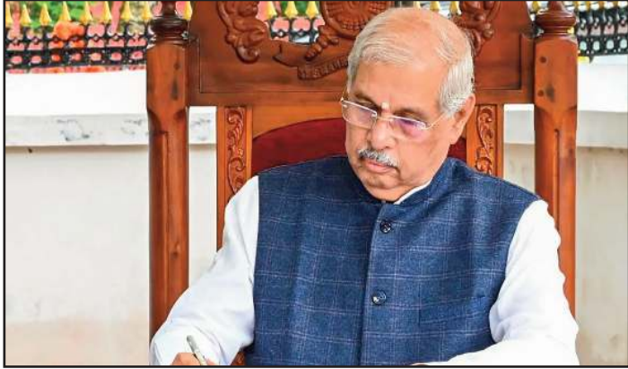
appealed to the people of Kerala to wholeheartedly support this initiative and uphold the spirit of Lok Bhavan. Earlier, the Governor's office released photos and videos showing