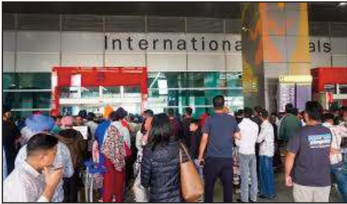
ground-based navigational aids. "Some flights reported GPS spoofing in the vicinity of IGLA, New Delhi while using GPS based landing procedures, while approaching on RWY 10. Contingency procedures