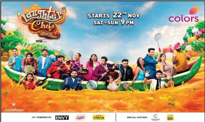
Laughter Chefs Unlimited Entertainment