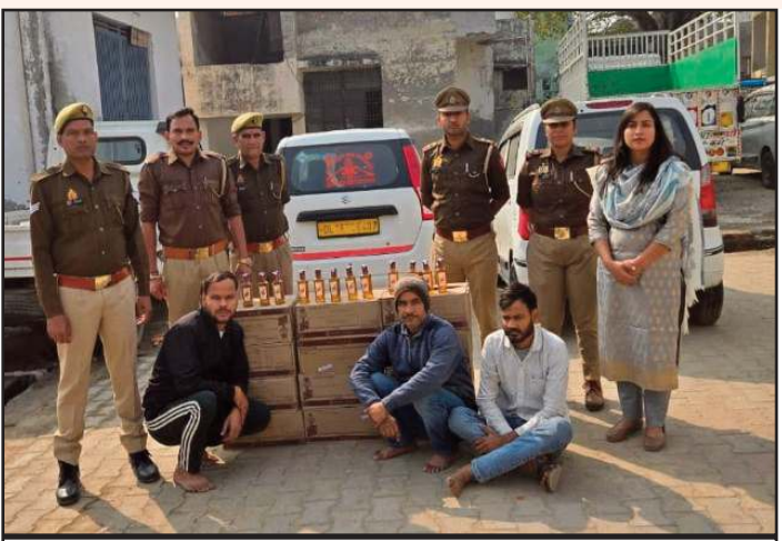
The accused is in police custody