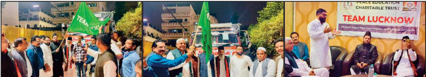
Flagged off a vehicle loaded with relief material for Uttarakhand flood victims

Lucknow, 10 November 2025 (Correspondent): To help the people affected by the floods in Uttarakhand, Team Lucknow took a commendable initiative and sent a