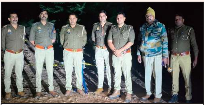
Mahavan police team present at the spot

One injured after being shot in Mahavan area, deceased’s mobile and bike recovered Mathura. There was an encounter between the police and the wanted accused in Mahavan police station area. During this time, two accused wanted in the murder case have been arrested. In the encounter, one accused was injured by bullet, while the other was caught from the spot. Police have recovered illegal weapons, cartridges, mobile phone of the deceased and the motorcycle used in the incident from them. This encounter took place on the service road going to Madanpur on Yamuna Expressway on Sunday night. Police had received information that the