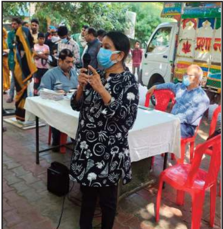
Making the villagers aware by the District Tuberculosis Department through Mandona Rural Development Foundation.

but it is necessary to complete the treatment regularly. Nutritious food, awareness and timely testing are the pillars of