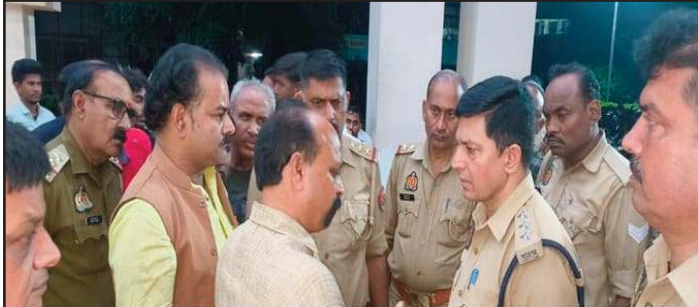
Police arrived after the incident