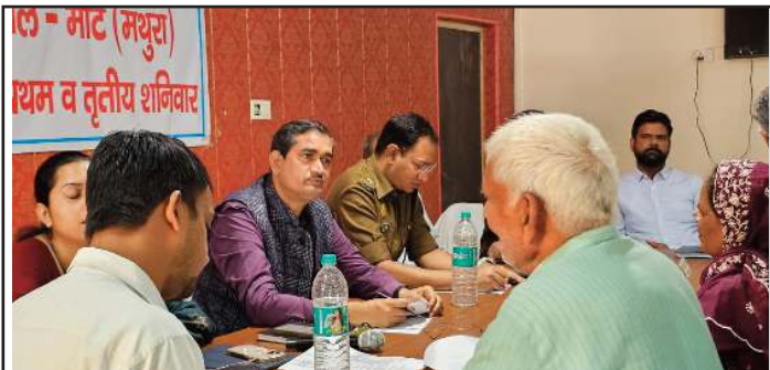
DM-SSP listening to people's problems and giving instructions to subordinates for quick solution