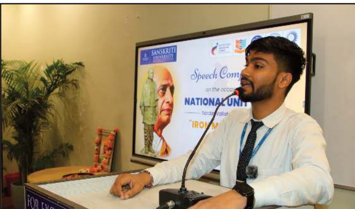
Students of Sanskriti University celebrated Unity Day