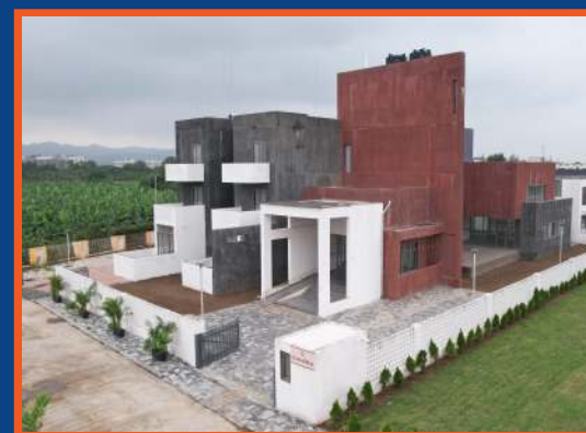
Birsa Munda Bhavan

Date: 30-10-2025, Thursday | Time: 4.00 PM Venue: Ekta Nagar, Dist.:Narmada