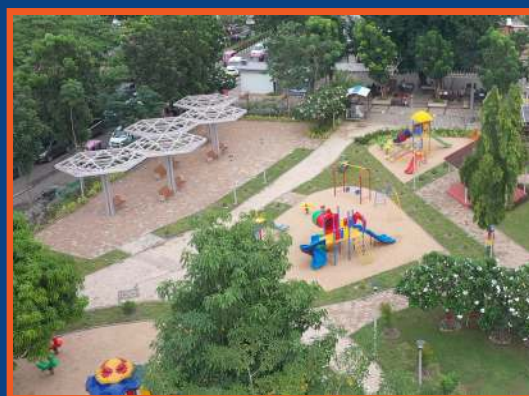
Shreshtha Bharat Bhavan Garden