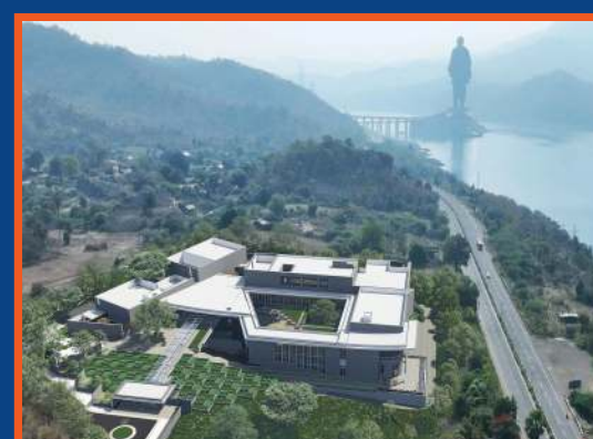
Royal Kingdoms of India Museum