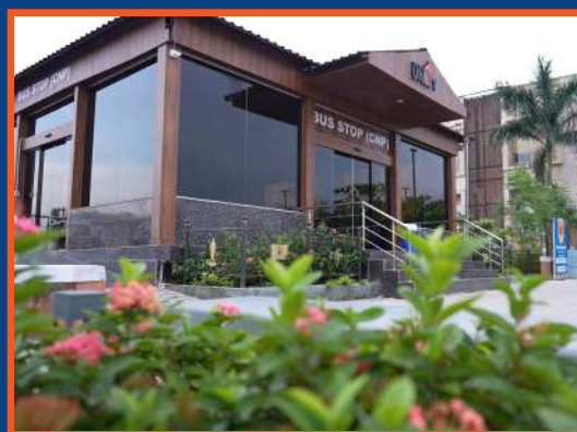
Smart Bus Terminal