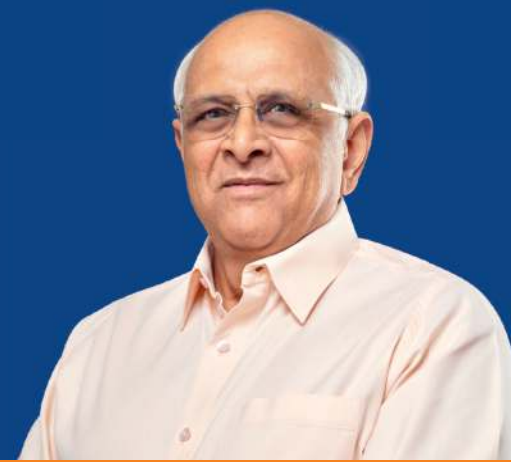
Shri Narendra Modi Hon'ble Prime Minister