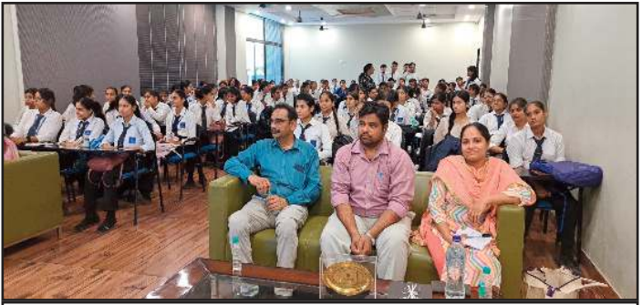
Students and teachers of Sanskriti University listening to the expert speaker in the auditorium located in G Block of Sanskriti University.