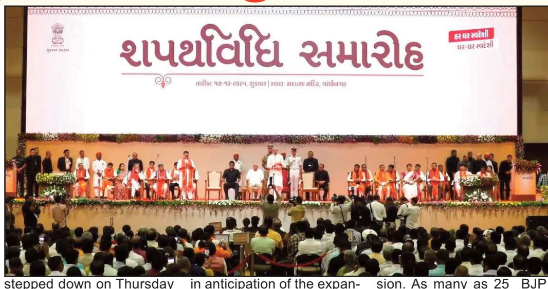
stepped down on Thursday in anticipation of the expansion. As many as 25 BJP

(Gns). Earlier today, the Chief Minister held a meeting with Governor Acharya Devvrat at Rajbhavan. The meeting was part of the formal process ahead of the cabinet expansion. Gujarat governor Acharya Devvrat on Friday administered oath to the newly elected Cabinet of Bhopendra Patel-led government. Harsh Sanghani has been sworn in as Gujarat's deputy chief minister. Barring CM Patel, Gujarat's entire Cabinet