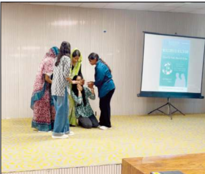
A scene of the drama presented by the students during the program organized in the auditorium of Sanskriti University.