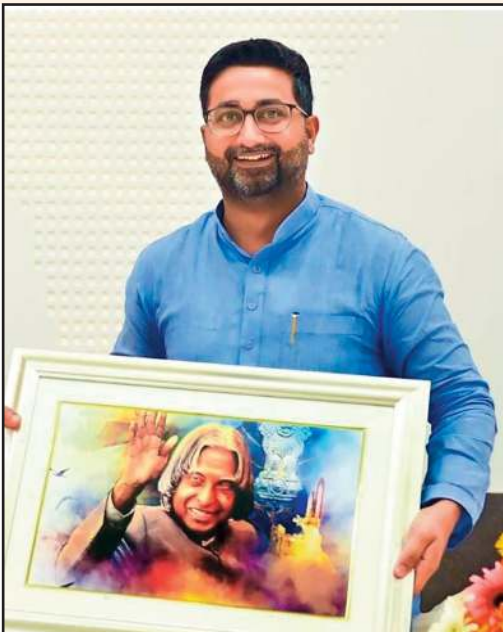
them with the scientific