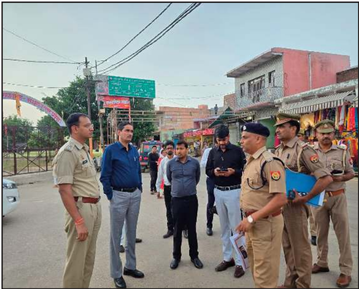
DM and SSP giving instructions to provide strong arrangements to the devotees in the fair