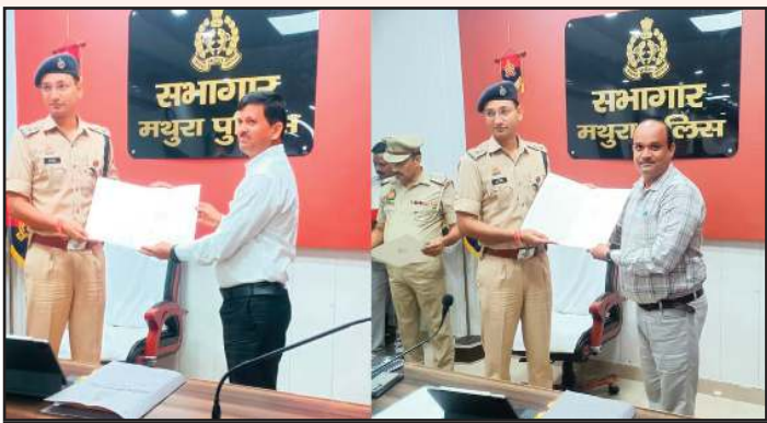
Lawyer honoring SSP with citation

Mathura. Yesterday, the Senior Superintendent of Police in the district called and honored the government advocates in the Police Line auditorium. It should be noted that the Yogi government has announced that the government lawyers engaged in the cases in which conviction or disposal is done within 2 months will be honored, so that the rule of law is strengthened in the state and the cases are also disposed of as soon as possible. In this series, SSP Mathura honored those advocates of