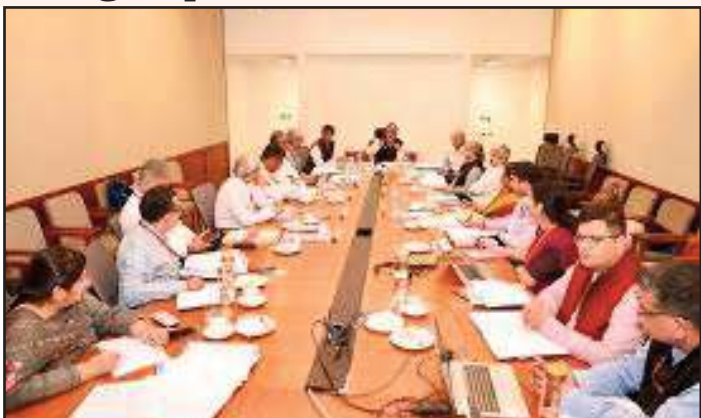
(ANRF) today approved the establishment of a special

(Gns). In a significant milestone towards operationalization of the transformative Research Development and Innovation (RDI) Fund, launched by the Government to encourage the private sector to scale up research, development, and innovation (RDI) in sunrise domains, the Executive Council of the Anusandhan National Research Foundation