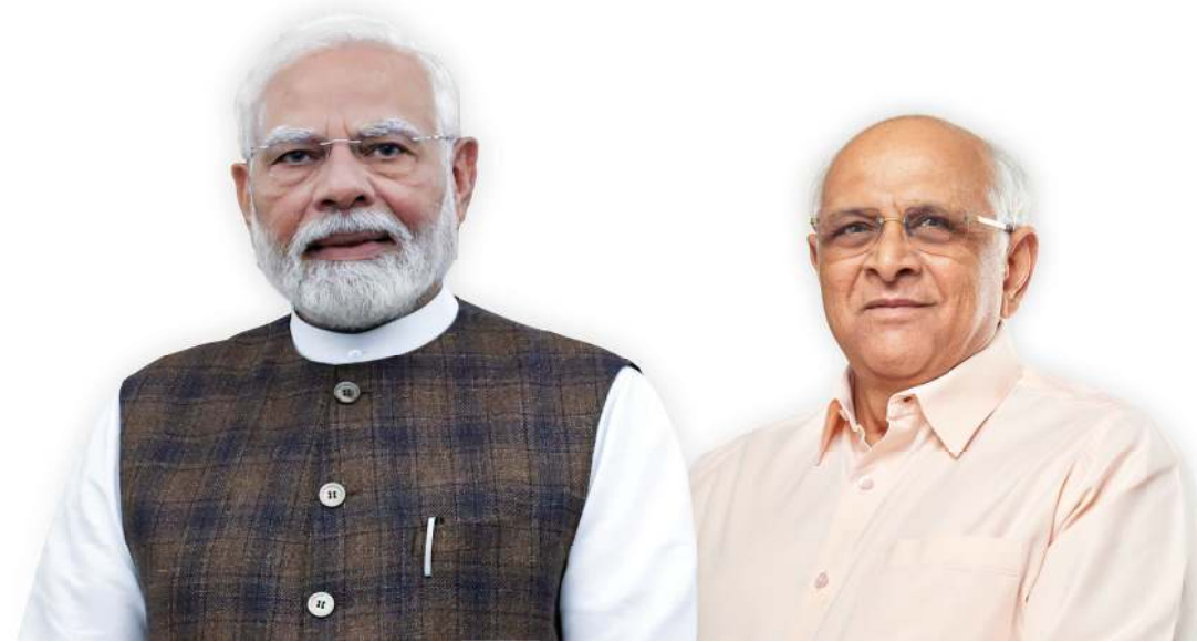
Shri Narendra Modi Hon'ble Prime Minister