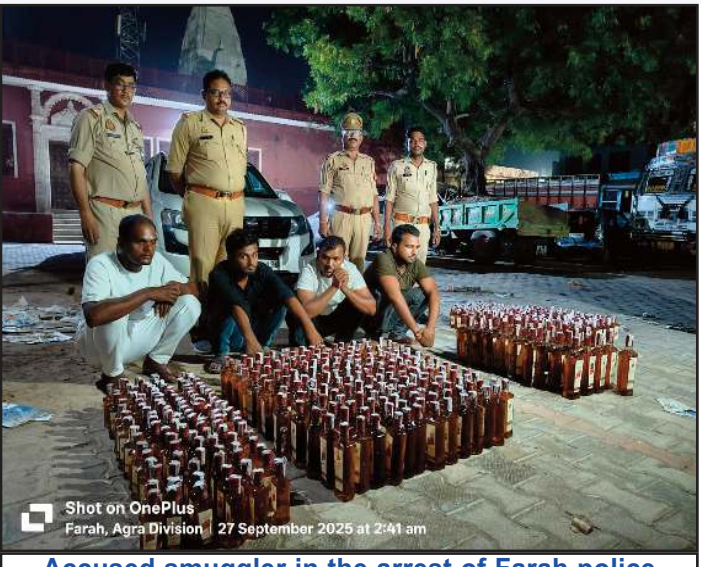
Accused smuggler in the arrest of Farah police

The police were informed about the smugglers from the informer. Based on this information, the local police started checking vehicles on Mahuan toll. A white colored Mahindra car appeared during checking. When the police tried to stop him, the driver