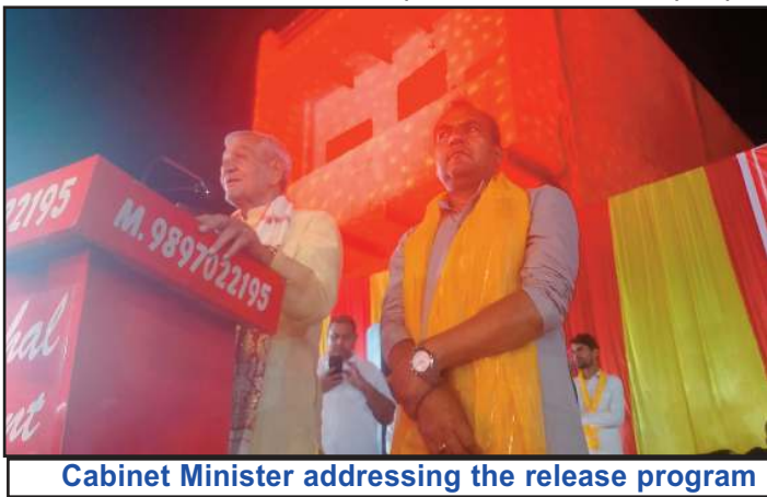
Cabinet Minister addressing the release program

Victoria Lighting, including painting related to Ram's pastimes, which has become the center of people's attractive people.