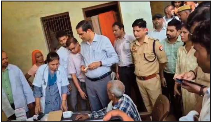
Giving food from their own hands to flood victims

kits to the flood -affected families present in the flood relief camp and they all go to their efficiency. He heard