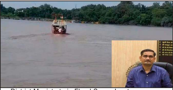
District Magistrate in Flood Scene Inset

Yamuna is in spate in Mathura. Things are deteriorating in the river banks with water entering the fields. In such a situation, the holiday of two days of schools has been declared. Along with this, the parikra-