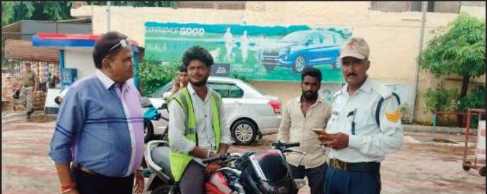
ARTO's team explaining the vehicle owner under the campaign of "No Helmet-No Fuel"