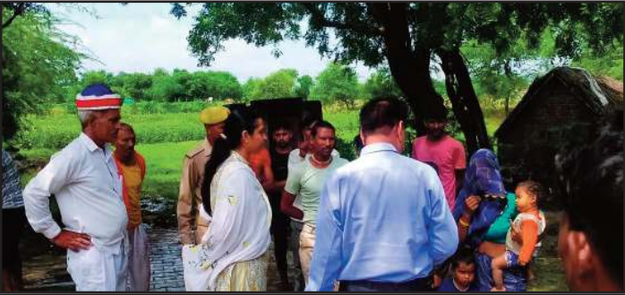
SDM listening to the problems of the people