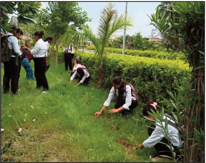
Students taking admission in the new session planting trees in the university under the Deeksharam 2025 at Sanskriti University.