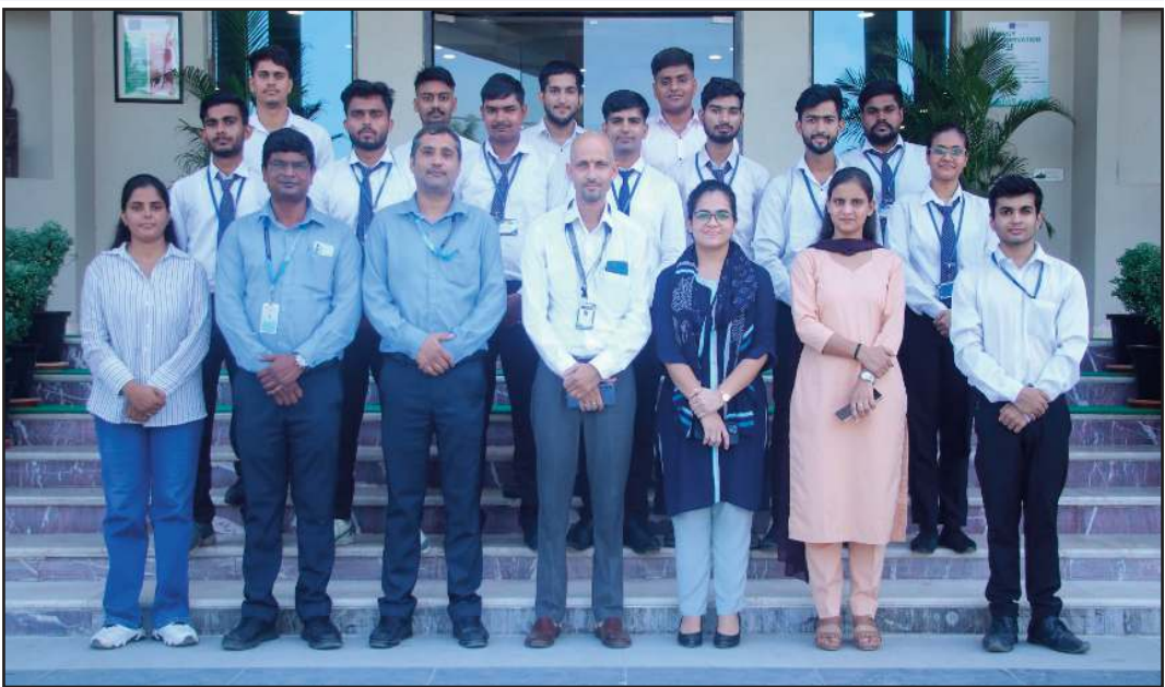
The students of the sanskriti and officers of the placement cell by Navratna Company Bharat Electric Limited came for campus placement at sanskriti University.