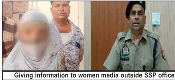
Giving information to women media outside SSP office