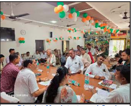
District Magistrate and Senior Superintendent of Police listening to complaints of complainants