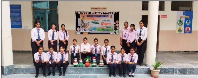
In the 'Meri Mati Mera Desh' program organized at Sanskriti University, students presenting the items made of potters beautifully.