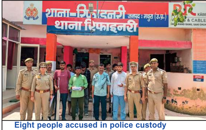
Eight people accused in police custody