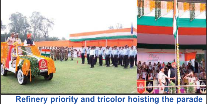
Refinery priority and tricolor hoisting the parade